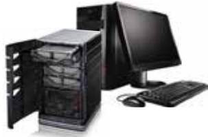
Desktop Computer / Server (Mac/Windows)