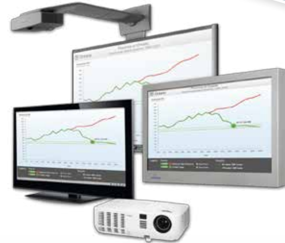
Projector, Display, Touchscreen or IWB