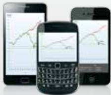
Mobile Devices (Apple/Android)